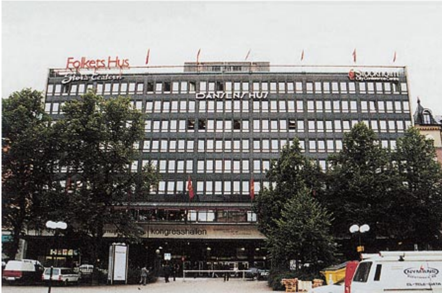
Conference venue (Stockholm City Conference Center)

under the conference theme, were drawing attention away from other pollutants such as chemical contaminants and other sources such as urban runoff. Indeed, the several presentations dealing with toxics suggested that the effects of these compounds are most pronounced on those coastal seas that have small watersheds relative to their size (surface area or volume). Despite these observations, it is clear that nutrient enrichment and its consequences in stimulating algal blooms and causing anoxia remain major world - wide concerns.