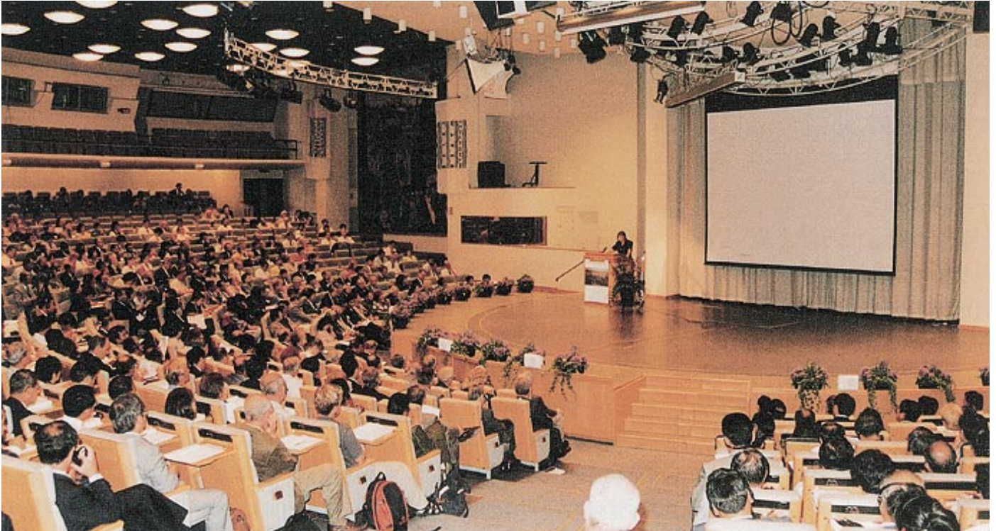
Official opening address by Ms. Brigitta Dahl, speaker of the Swedish Parliament, Sweden

The third International Conference on the Environmental Management of Enclosed Coastal Seas (EMECS) was held in Stockholm, Sweden for four days, from Monday, August 11 through Thursday, August 14, 1997, as a joint conference with the seventh Stockholm Water Symposium. This was the first international conference to be sponsored by the International EMECS Center, originally proposed by Hyogo Prefecture and established in 1994 through support from related organizations both at home and abroad. Twenty - five years ago, in 1972, Stockholm was the site of the [United Nations] Stockholm Conference on the Human Environment, at which the Declaration on the Human Environment was adopted - an event that could be called the starting point for our present - day efforts to solve environmental problems. Therefore 1997 marks a "triple anniversary":