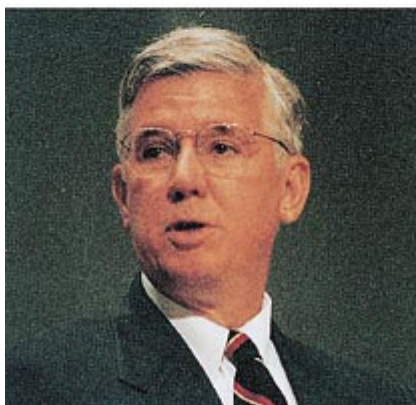
Governor Parris N, Glendening, Maryland State, USA

resources. Following the official opening of the conference, Mr. Toshitami Kaihara, governor of Hyogo Prefecture and chairman of the Executive Committee of the International EMECS Center, addressed the participants (Page 5). At the outset, Mr. Kaihara thanked all of the participants for the assistance offered by their respective countries during the Great Hanshin - Awaji Earthquake of January 1995, saying that their help had greatly encouraged the victims of the earthquake, and reported that recovery efforts were progressing steadily. Next, he expressed concern for the present water situation, noting that large quantities of pollutants were flowing into enclosed coastal seas around the world from land areas, causing eutrophication, oil pollution and other problems, thus worsening the habitats of living organisms and reducing fish catches. While national and local governments were actively working to resolve this situation, he said, it was feared that the situation in coastal areas would worsen due to increased development, the centralization of population in these areas and other factors. He promised that the International EMECS Center would work harder to resolve these problems. Next, Mr. Parris N. Glendening, governor of the State of Maryland in the United States, welcomed the participants and cited Mr. Kaihara and the