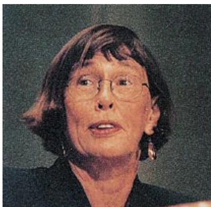
Ms. Brigitta Dahl, speaker of the Swedish Parliament, Sweden