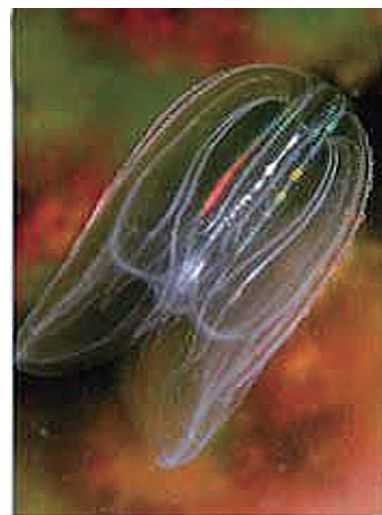
Invasive species, American comb jelly ( Mnemiopsis leidyi ): a major problem for the Black Sea 11

The mass occurrence of Mnemiopsis is now acknowledged to have contributed to the sharp decrease in no less than 26 commercial Black Sea fish stocks, including anchovy and chub mackerel. Local oyster fisheries, indigenous jellyfish and even endemic dolphins also suffered. The impact was all the more devastating as the Black Sea was already under stress for heavy fishing and eutrophication. The economic cost attributed to the collapse of fisheries and tourism industries around the Black Sea is estimated at 500 million dollars per year. 11