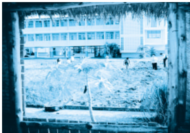
A view from the environmental education classroom onto the working landscape of the Nakhon Pathom Special Studying School where students learn organic farming and other methods of environmentally sustainable agriculture.

"We visited the Tha Chin River. People built their houses above it. They were so beautiful and calm. People living there depended on the river. The river produced plants and many traditions. People