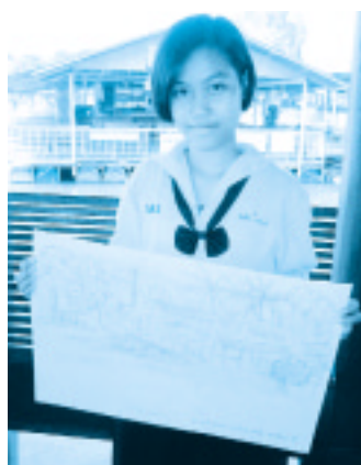
A 9 th grade student at the Wat Don Wai School conveys her sense of the relationship between clean environment and quality of life by showing her art against a backdrop of the Tha Chin River and the community in which her school is located.

have learned how to save their water in many ways, as the Thai students showed us . . . They had warm hearts and their eyes were shining. They saw us off with tears. I was deeply impressed." Environmental education can reconnect young people with nature, with their heritage, and with the global community.