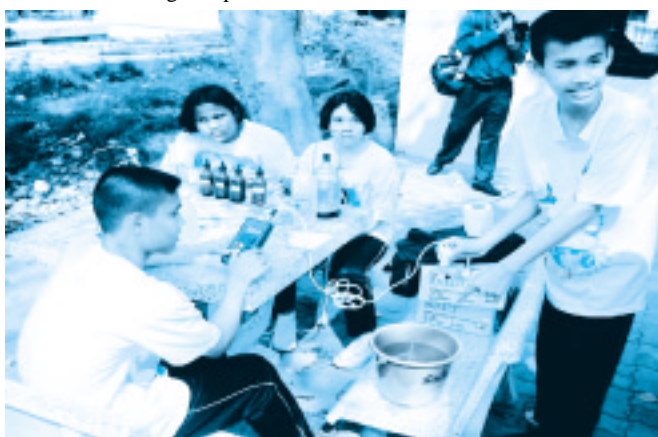
Middle school "River Detectives" at the Wat Don Wai School demonstrate how they analyze a water sample taken minutes before from the Tha Chin River.