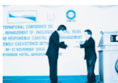
Best Poster Awards Presentation