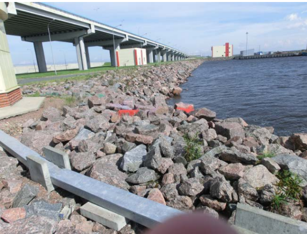
Flood Protection Barrier