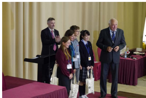
Best Poster awards

After the closing ceremony, a gala dinner was held to celebrate the success of the conference and to facilitate the deepening of exchanges among the participants from various countries in anticipation of the next EMECS conference.