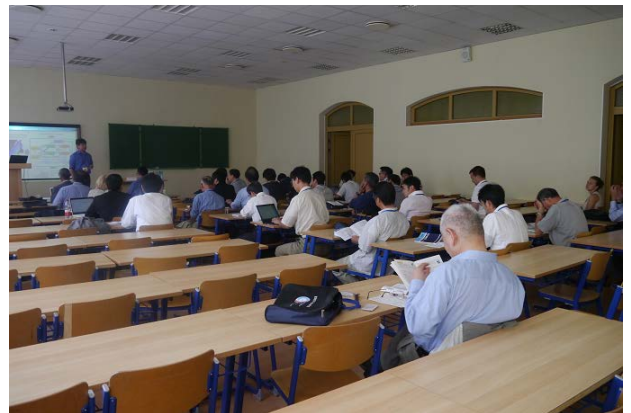
Session at the Russian State Hydrometeorological University