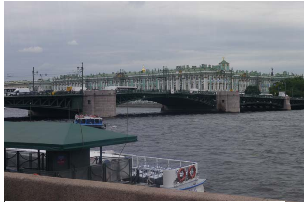
Neva river and Hermitage Museum