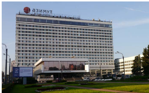
Main venue: Azimut Hotel, St. Petersburg