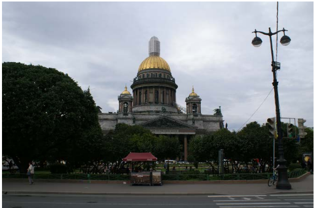
St. Isaac's Cathedral