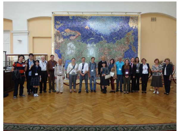
A.P.Karpinsky Russian Geological Research Institute Museum