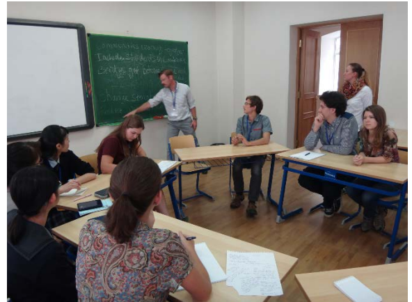
Discussion by SSP session participants

The students also broadened their knowledge by participating in the city tour that was held on the afternoon of Tuesday, August 23 and the technical excursion that was held on Saturday, August 27.