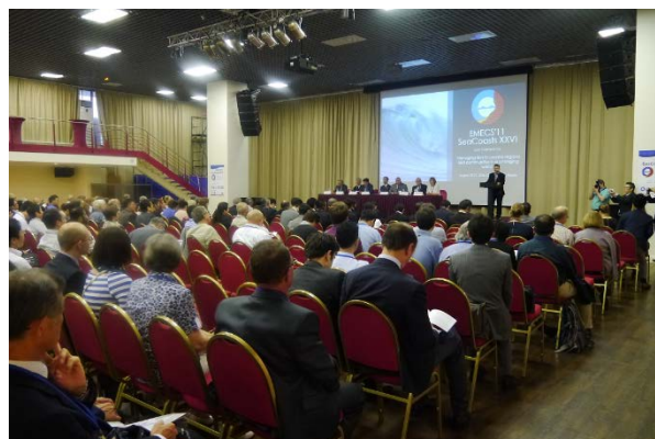
Opening Ceremony (Azimut Hall)