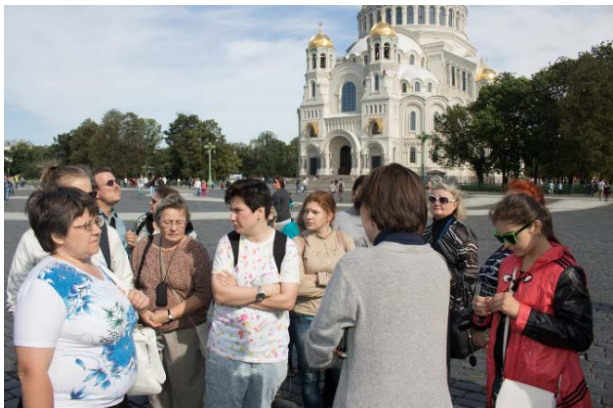
City of Kronstadt